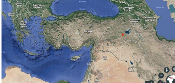
Figure 1. Distribution of Salvia siirtica [10]

Sage seeds were collected after maturation from Tillo district of Siirt province (in oak forest openings at 37 degrees 58 minutes 13 seconds north - 42 degrees 01 minutes 53 seconds east, 1473 m altitude) in November.